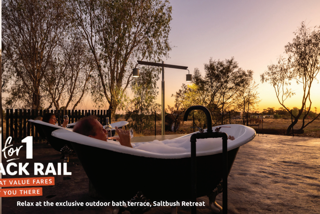
Relax at the exclusive outdoor bath terrace, Saltbush Retreat