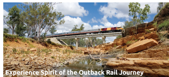
Experience Spirit of the Outback Rail Journey

2025/26 DEPARTURES 4 & 18 November; 2 December 2025; 10, 17 & 24 March 2026