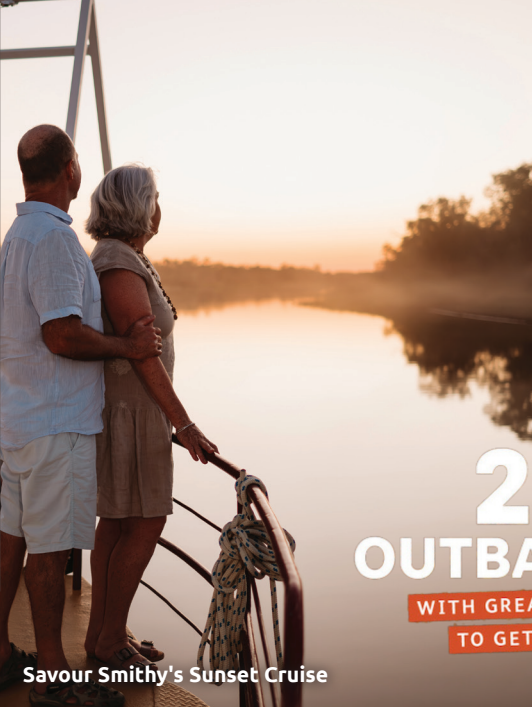
Savour Smithy's Sunset Cruise