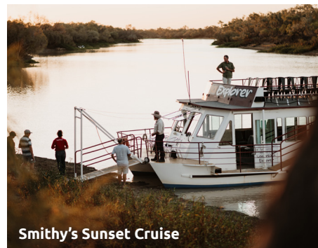
Smithy's Sunset Cruise