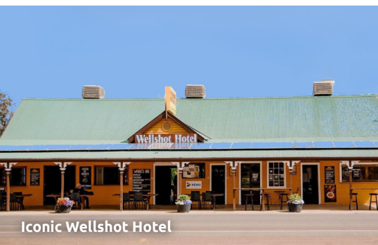
Iconic Wellshot Hotel

Disembark the Spirit of the Outback after an unforgettable week out west.