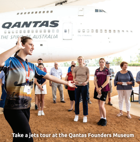
Take a jets tour at the Qantas Founders Museum