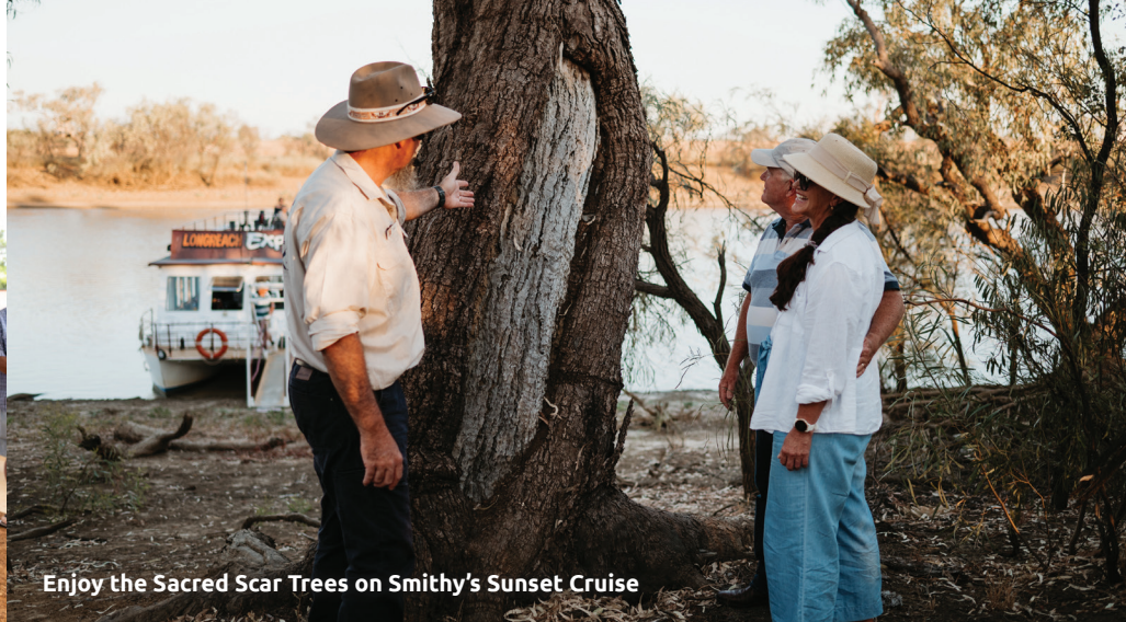
Enjoy the Sacred Scar Trees on Smithy's Sunset Cruise