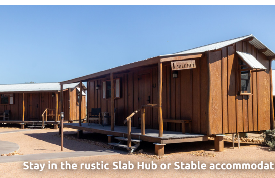
Stay in the rustic Slab Hub or Stable accommodation at Saltbush Retreat