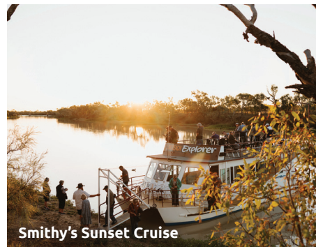
Smithy's Sunset Cruise