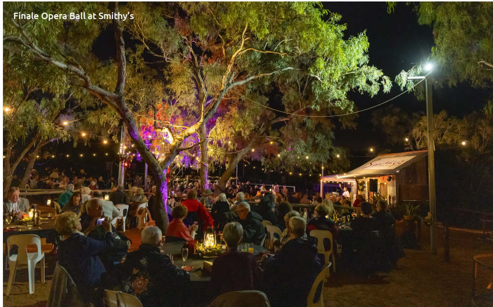
Finale Opera Ball at Smithy's