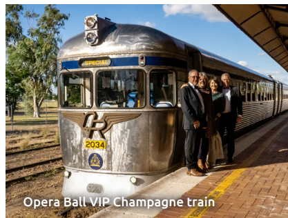
Opera Ball VIP Champagne train