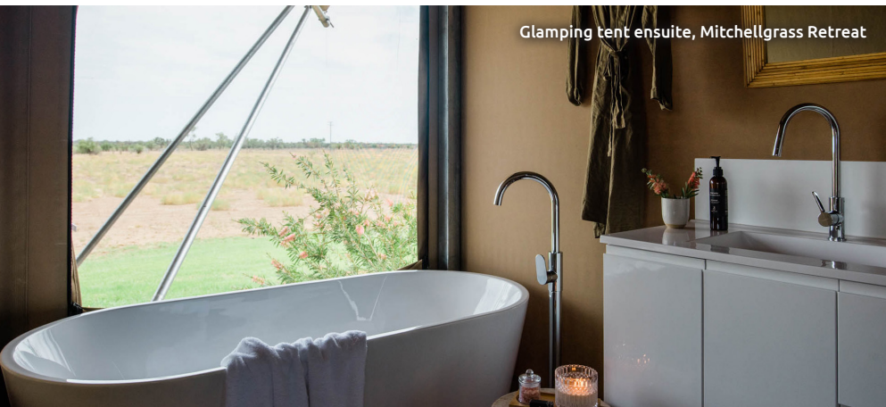
Glamping tent ensuite, Mitchellgrass Retreat

(B) = Breakfast (L) = Lunch (D) = Dinner