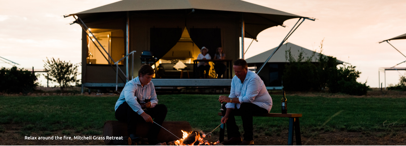
Relax around the fire, Mitchell Grass Retreat

tea and damper. When the music shifts, the dancefloor comes alive with an upbeat DJ set, the bar stays open, and you're invited to dance the night away beside the Thomson River.