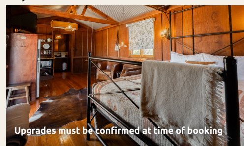
Upgrades must be confirmed at time of booking