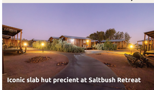
Iconic slab hut precinct at Saltbush Retreat