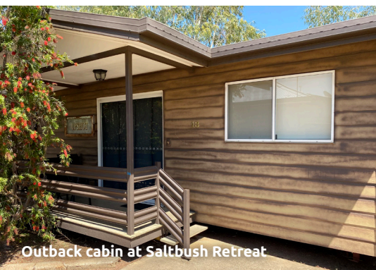
Outback cabin at Saltbush Retreat

5 nights at Saltbush Retreat - Outback Cabin