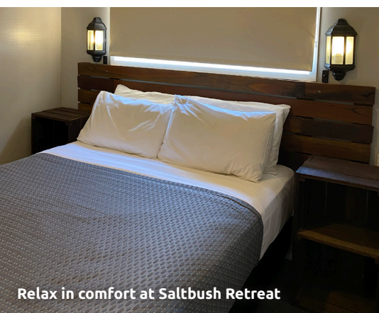
Relax in comfort at Saltbush Retreat