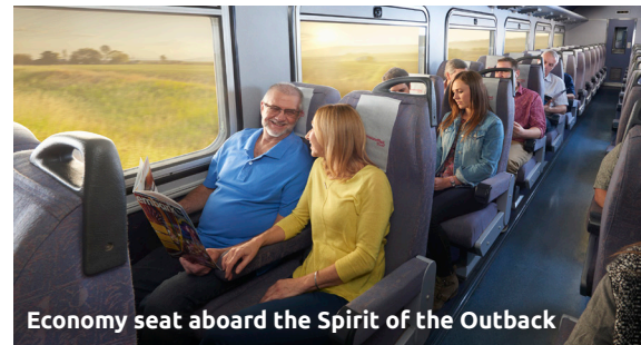
Economy seat aboard the Spirit of the Outback

(B) = Breakfast (D) = Dinner (S) = Supper (L) = Lunch