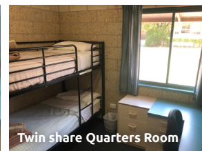
Twin share Quarters Room