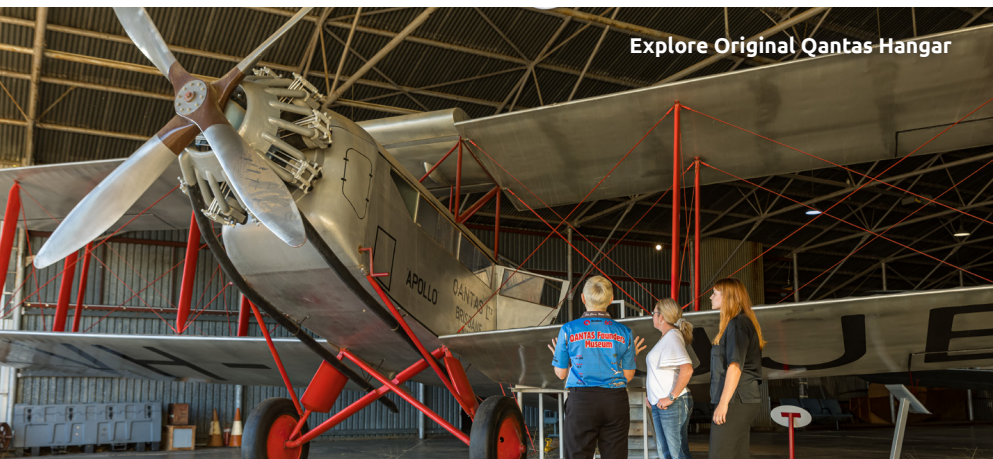
Explore Original Qantas Hangar