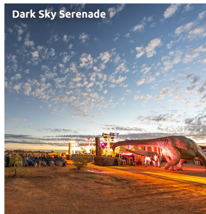
Dark Sky Serenade

Enjoy a relaxed morning before joining Sing, Sing, Sing at The Drover's Place Cottage. Led by Opera Queensland artists, this uplifting event invites singers of all experience levels to come together for a morning of music, laughter and connection - a fitting finale to your Festival of Outback Opera journey. After lunch, explore the Qantas Founders Museum and uncover the inspiring story of Australia's iconic airline. Enjoy a guided interpretive tour, stepping aboard the 747 City of Bunbury for a peek inside the flight deck and crew rest area, and marvel at the Super Constellation, Qantas' first pressurised aircraft. Your Festival of Outback Opera adventure concludes with a transfer to Longreach Airport. (B) (L)