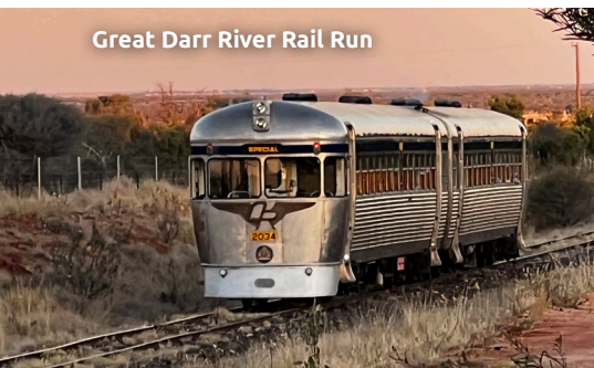
Great Darr River Rail Run

This morning, step aboard the historic 2000-class rail motor at Longreach Railway Station. Feel the rhythm of the rails as the journey reveals wildlife, waterholes, and