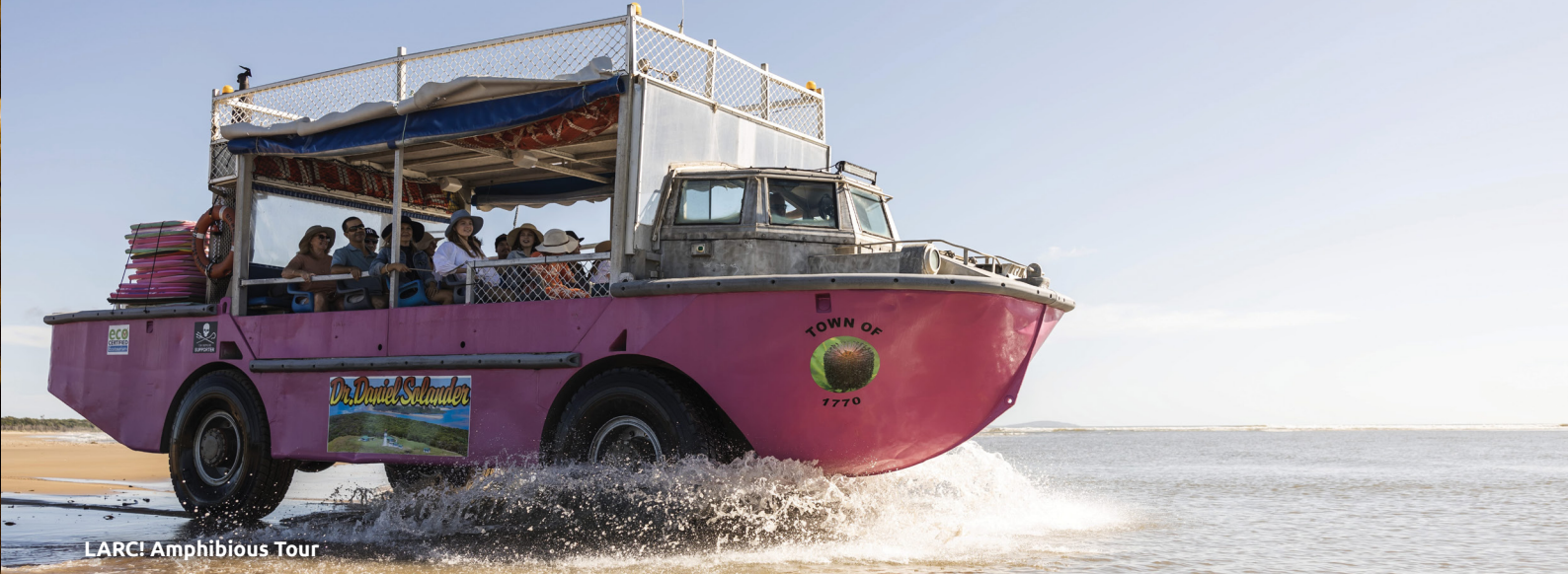
LARC! Amphibious Tour