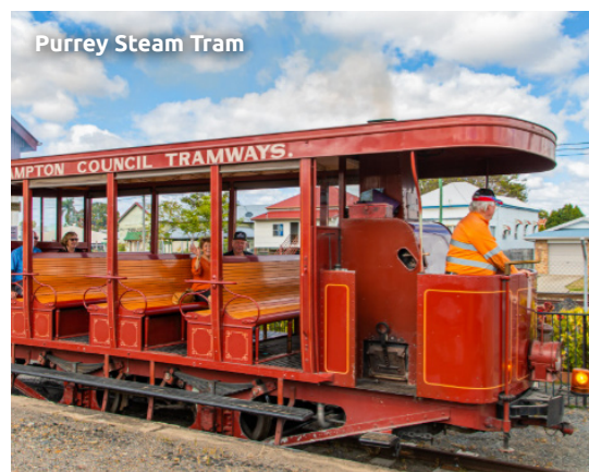
Purrey Steam Tram