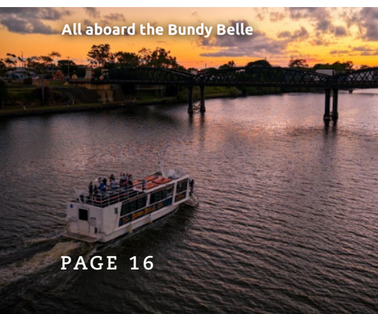
All aboard the Bundy Belle