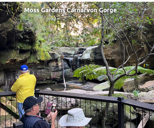
Moss Gardens Carnarvon Gorge