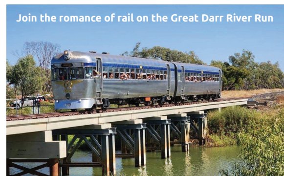
Join the romance of rail on the Great Darr River Run