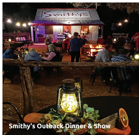
Smithy's Outback Dinner & Show