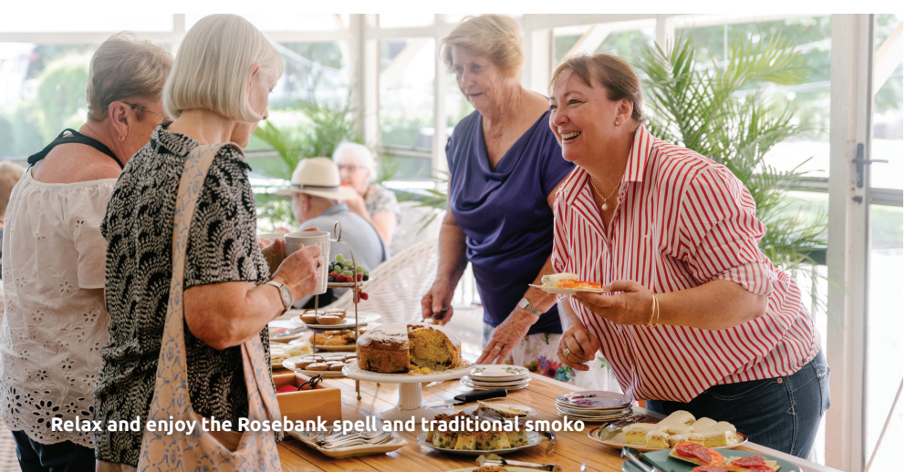
Relax and enjoy the Rosebank spell and traditional smoko

2 nights Boulder Opal Motor Inn or Winton Outback Motel