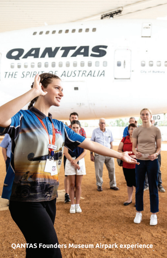
QANTAS Founders Museum Airpark experience