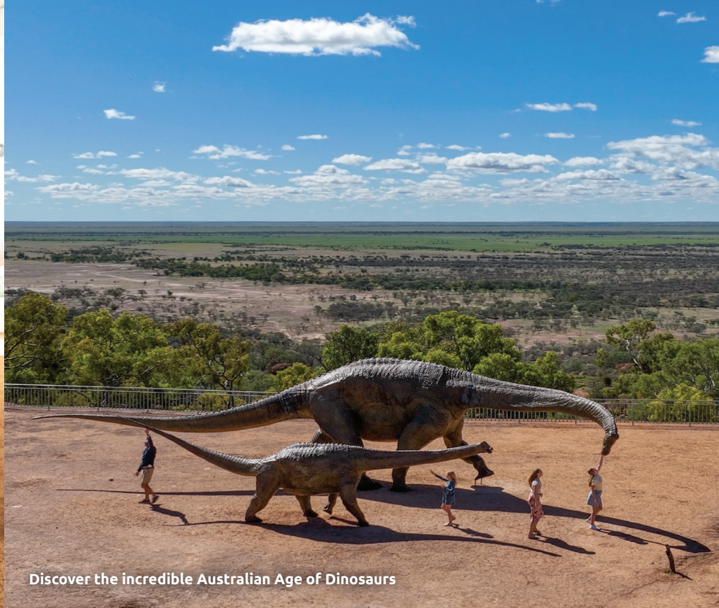
Discover the incredible Australian Age of Dinosaurs