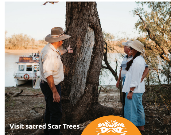
Visit sacred Scar Trees