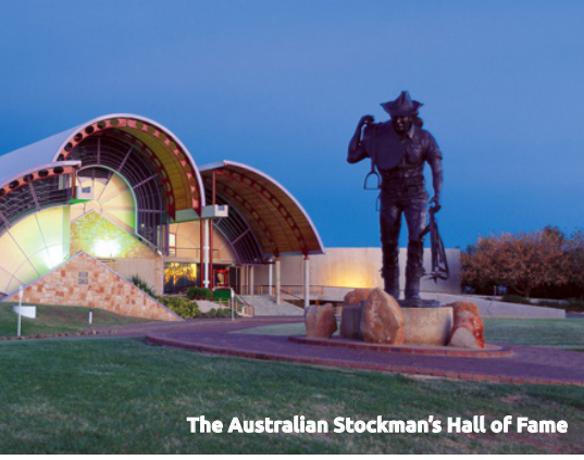
The Australian Stockman's Hall of Fame