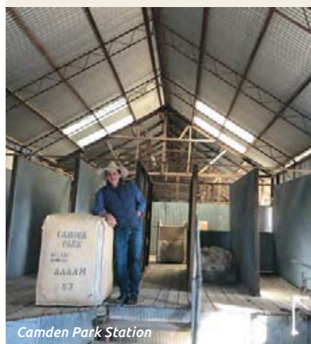
Camden Park Station