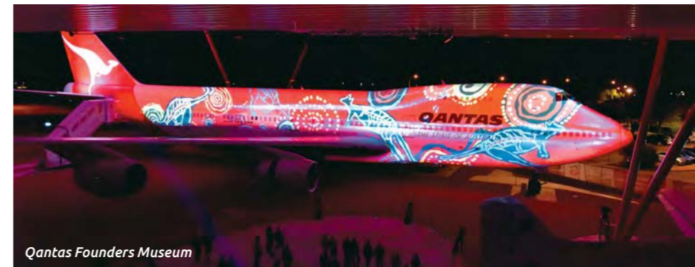
Qantas Founders Museum