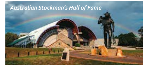
Australian Stockman's Hall of Fame