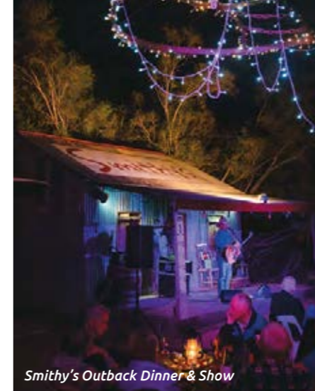
Smithy's Outback Dinner & Show