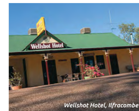
Wellshot Hotel, Ilfracombe