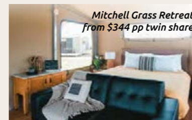
Mitchell Grass Retreat from $344 pp twin share