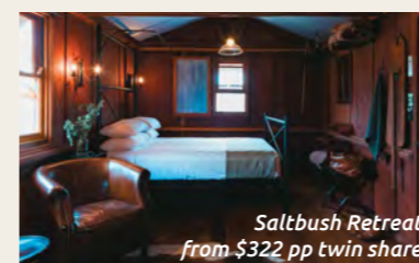
Saltbush Retreat from $322 pp twin share