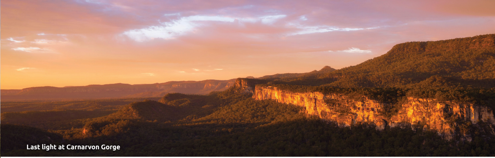
Last light at Carnarvon Gorge