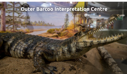
Outer Barcoo Interpretation Centre