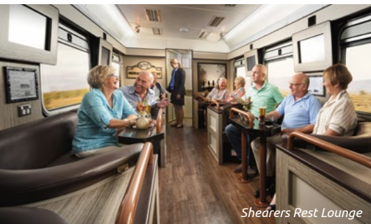
Shearers Rest Lounge