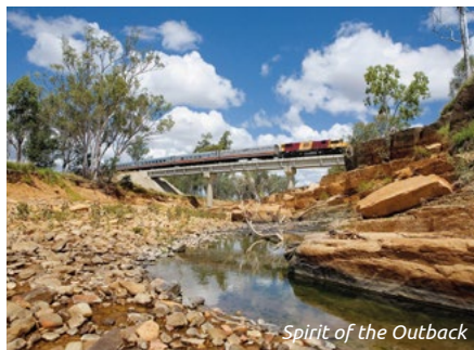
Spirit of the Outback