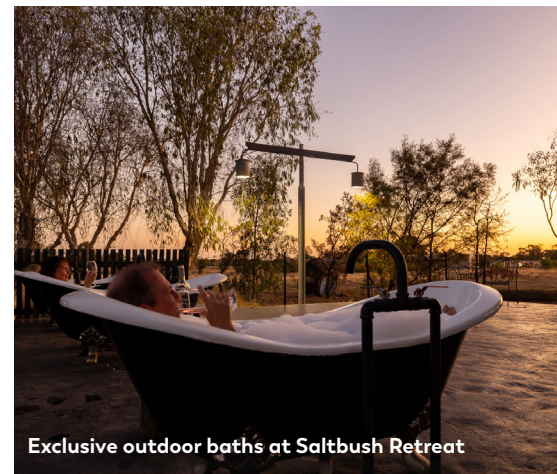
Exclusive outdoor baths at Saltbush Retreat