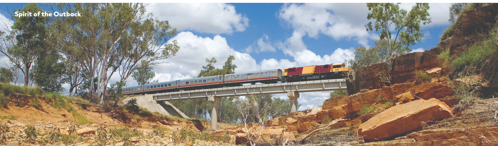
Spirit of the Outback