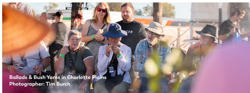
Ballads & Bush Yarns in Charlotte Plains