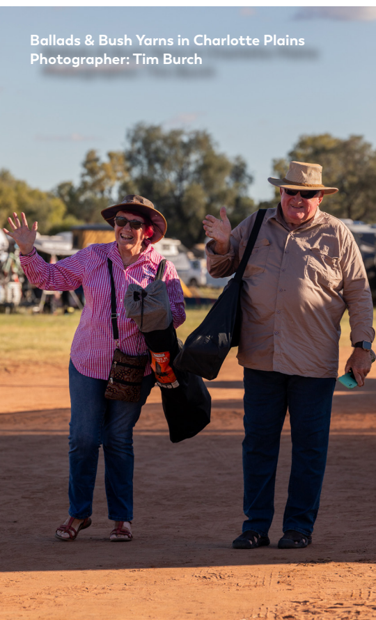
Ballads & Bush Yarns in Charlotte Plains

After breakfast, visit the Longreach School of Distance Education, one of the largest classrooms in the world. Learn how students across thousands of kilometres connect through technology and dedicated teachers. Continue to the Australian Stockman's Hall of Fame, where powerful exhibits honour Australia's drovers, shearers, and bush pioneers. Late afternoon, unwind aboard the Drover's Sunset Cruise on the Thomson River, where reflections of crimson skies ripple across calm waters. As night falls, step ashore for a camp-oven dinner and live music at Smithy's Outback Dinner & Show—a relaxed evening filled with laughter, song, and starlight. (B) (L) (D)