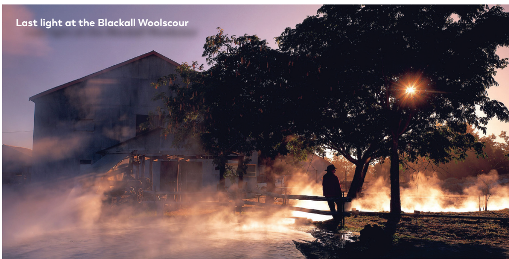
Last light at the Blackall Woolscour