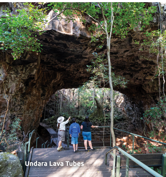
Undara Lava Tubes

Travel via Einasleigh Pub and Copperfield Gorge, where the river has carved striking basalt pools. Continue to the Lynd Junction Roadhouse, often billed as one of Australia's smallest towns. Take in sweeping views from Porcupine Gorge Lookout, nicknamed Australia's "Little Grand Canyon," before heading west to Richmond. Late afternoon, visit Kronosaurus Korner, Australia's premier