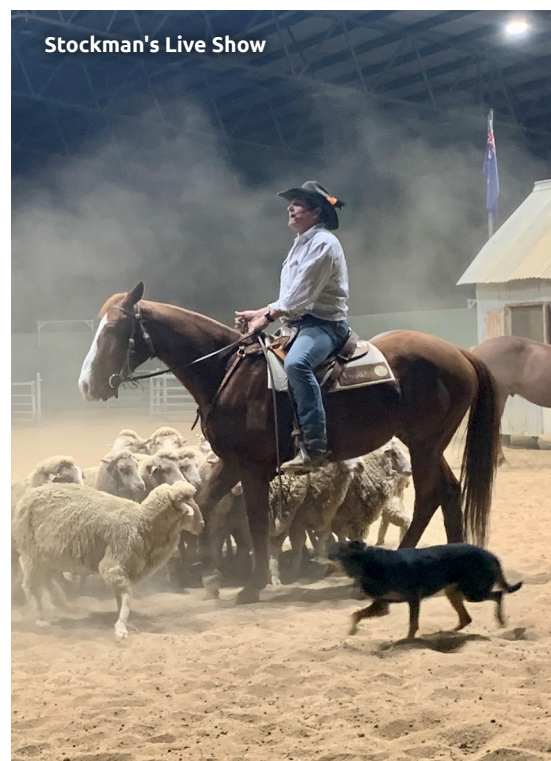
Stockman's Live Show

Board the Heritage rail motors for the Great Darr River Run and enjoy the changing scenery, wildlife and waterholes along the way. Step off for a short Mulga walk to learn about bush medicines before a homemade morning tea at the Darr River waterhole. Continue east to Ilfracombe, where you'll explore the Wellshot Centre, Machinery Mile and the famous Wellshot Hotel. In the late afternoon, relax on the Drover's Sunset Cruise with nibbles and stunning outback views, followed by live entertainment and a two-course camp oven