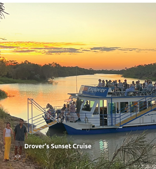
Drover's Sunset Cruise