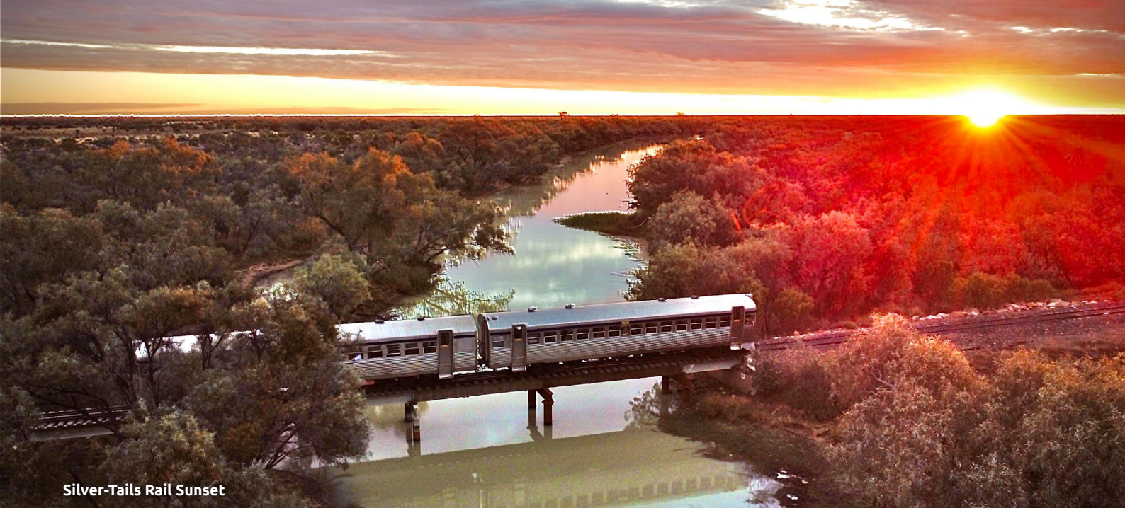
Silver-Tails Rail Sunset