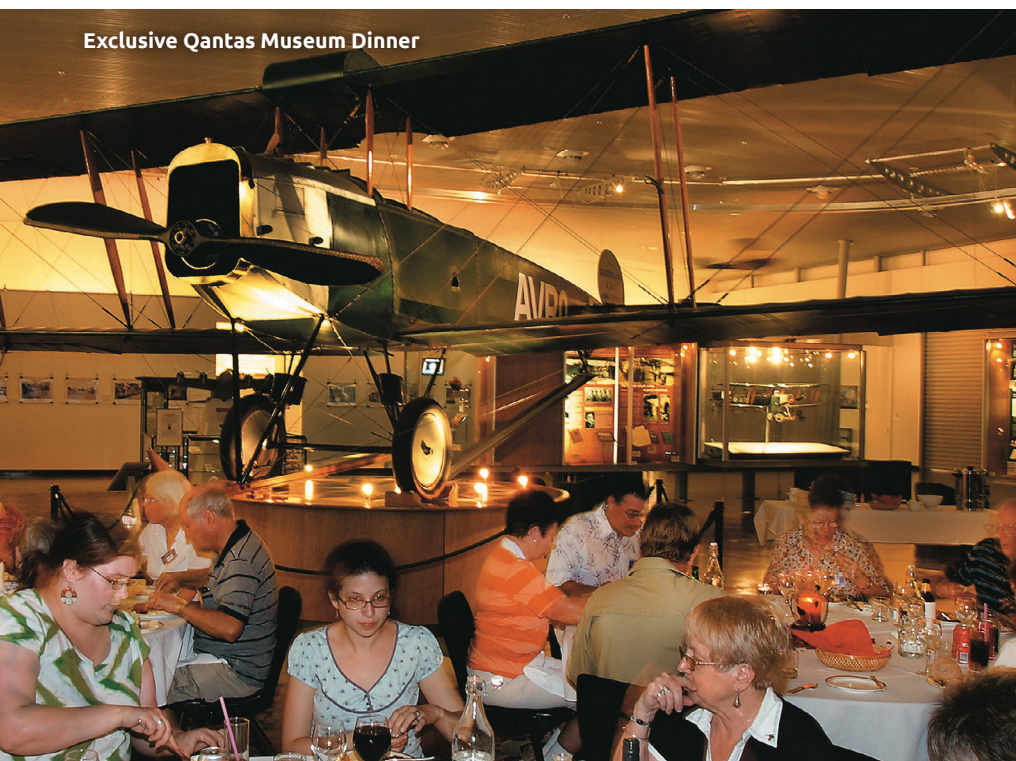
Exclusive Qantas Museum Dinner

Your Outback adventure will come to an end when following breakfast, we transfer you to your point of departure. (B)