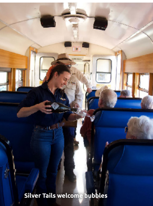
Silver Tails welcome bubbles

dinner under the stars at Smithy's Outback Dinner & Show. (B) (L) (D)