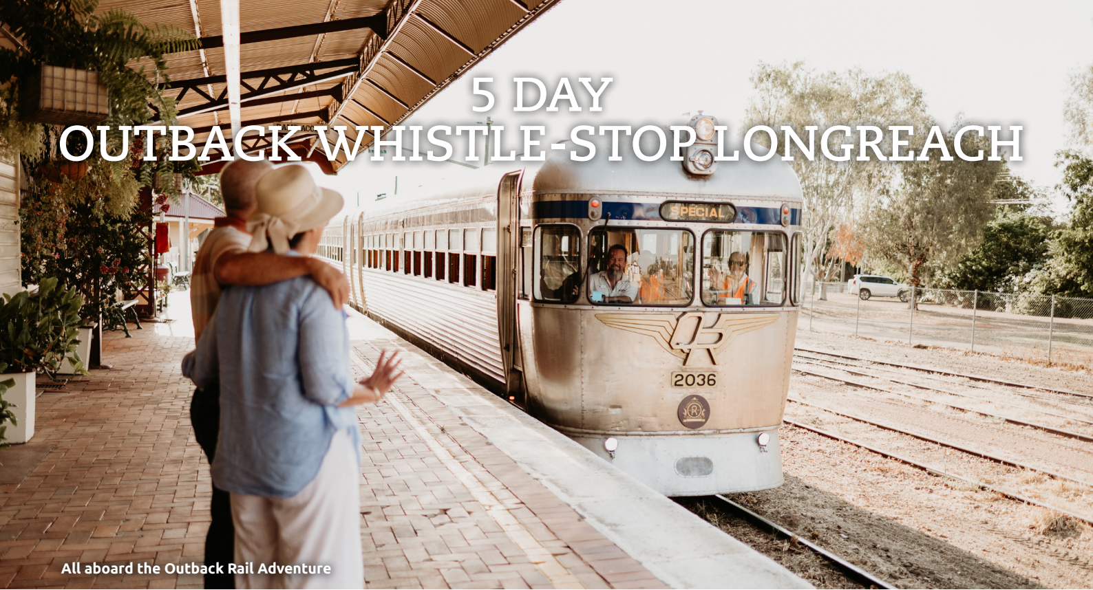
All aboard the Outback Rail Adventure

Discover a unique journey of rich heritage, contrasting rail adventures, a stunning river cruise and warm hospitality.